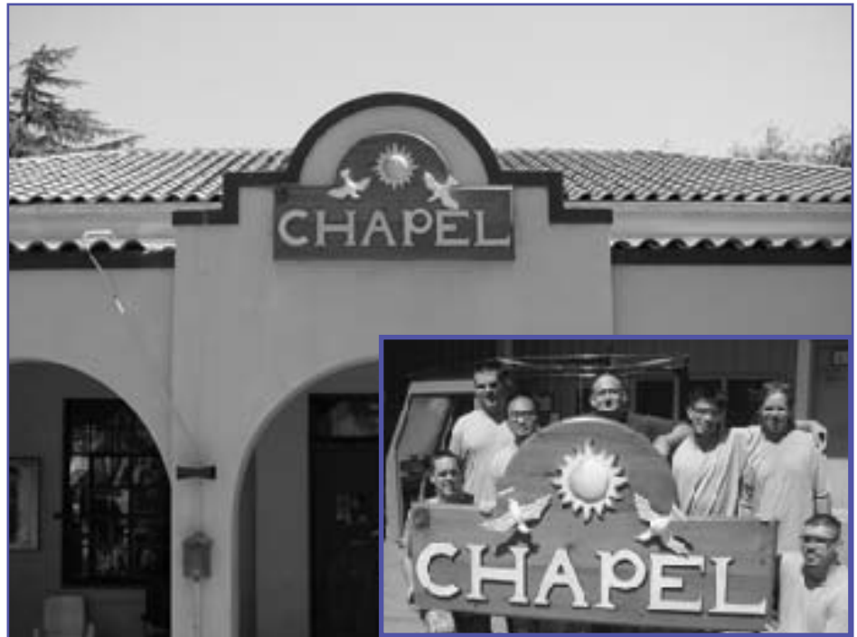
Inmate artists designed a new sign for the chapel at Elmwood.