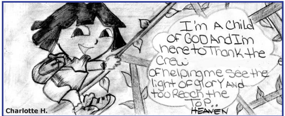
A young prisoner writes of her confidence and gratefulness for the help she's received from CIC during her incarceration.

One of our classes is called, "My family story." The girls make a sort of family tree (called a genogram). We